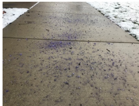
This is an example of an over-salted sidewalk with poor scattering. This sidewalk is no safer to walk on than one that is appropriately salted, and this over-application puts freshwater at risk.

The biggest problem with salt-use is over-application. Using salt when it will not work or simply putting too much down does not increase safety, instead, it puts our freshwater resources at risk. And in most circumstances, not that much salt is needed. Over-application can be avoided by lightly scattering salt and leaving 3" of space between the crystals.